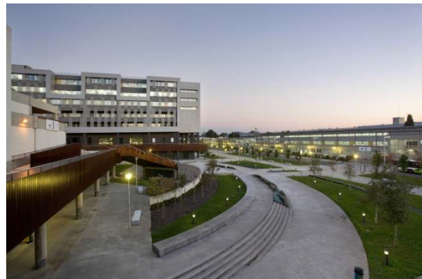
Vistasgenerales Area Leioa-Erandio