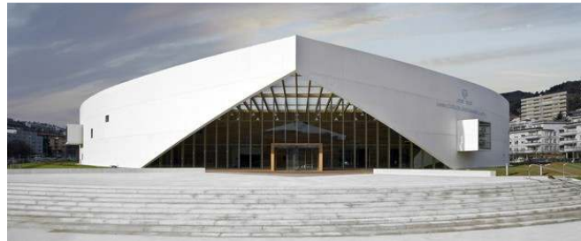
Centro Carlos Santamaría